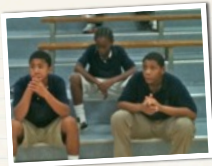
Middle school students showing SELF-DISCIPLINE as they wait for their turn in gym.